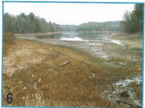
HydroQuest Photocomposite 1