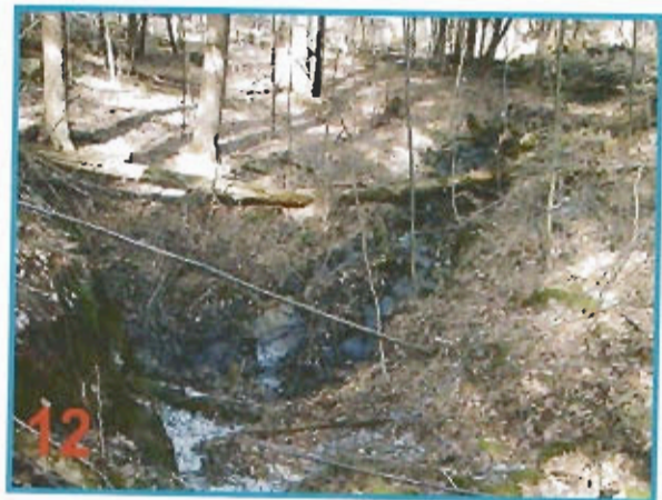
HydroQuest Photocomposite 2