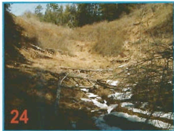
HydroQuest Photocomposite 4