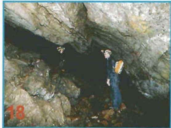
HydroQuest Photocomposite 3